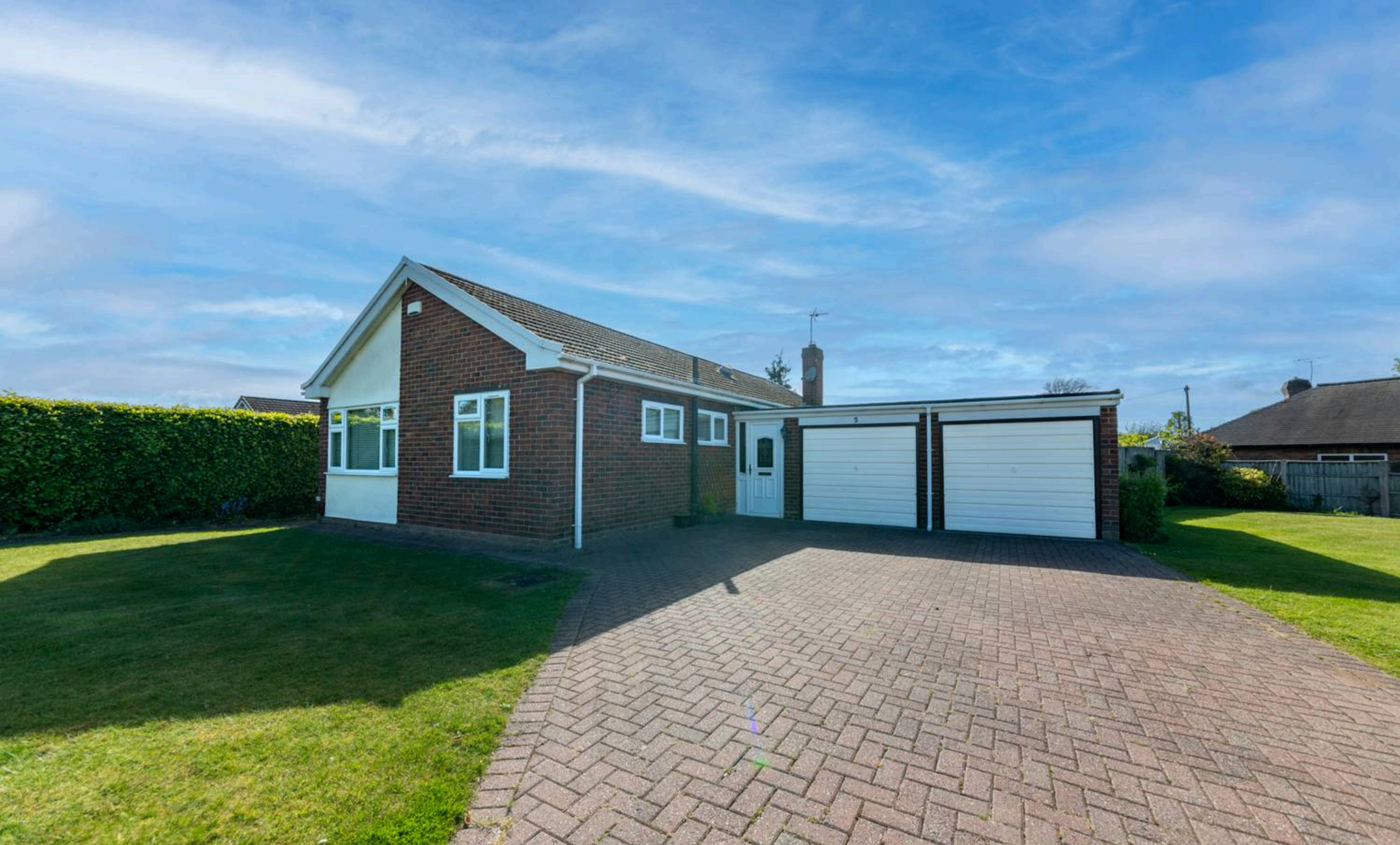
2 Gatesheath Drive, Upton £535,000