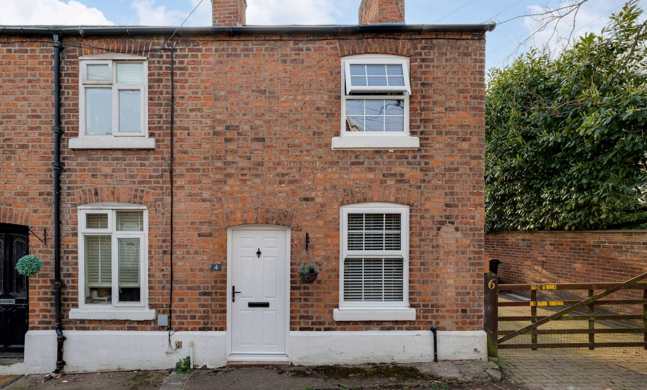
4 Overleigh Terrace, Handbridge £242,500