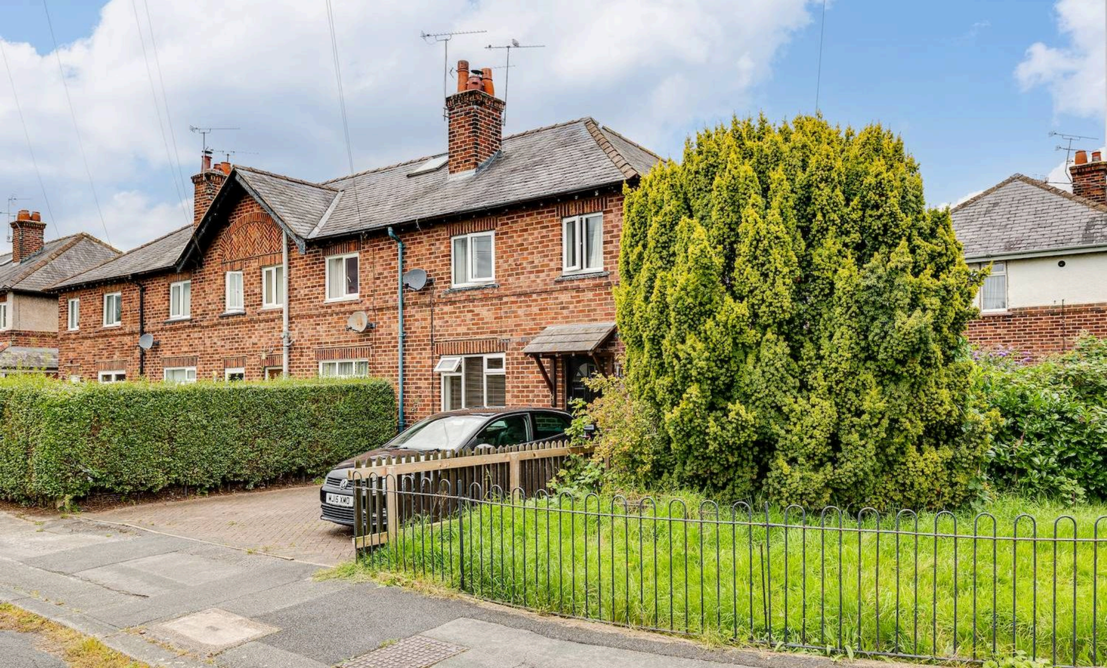
74 Beeston View, Chester £240,000