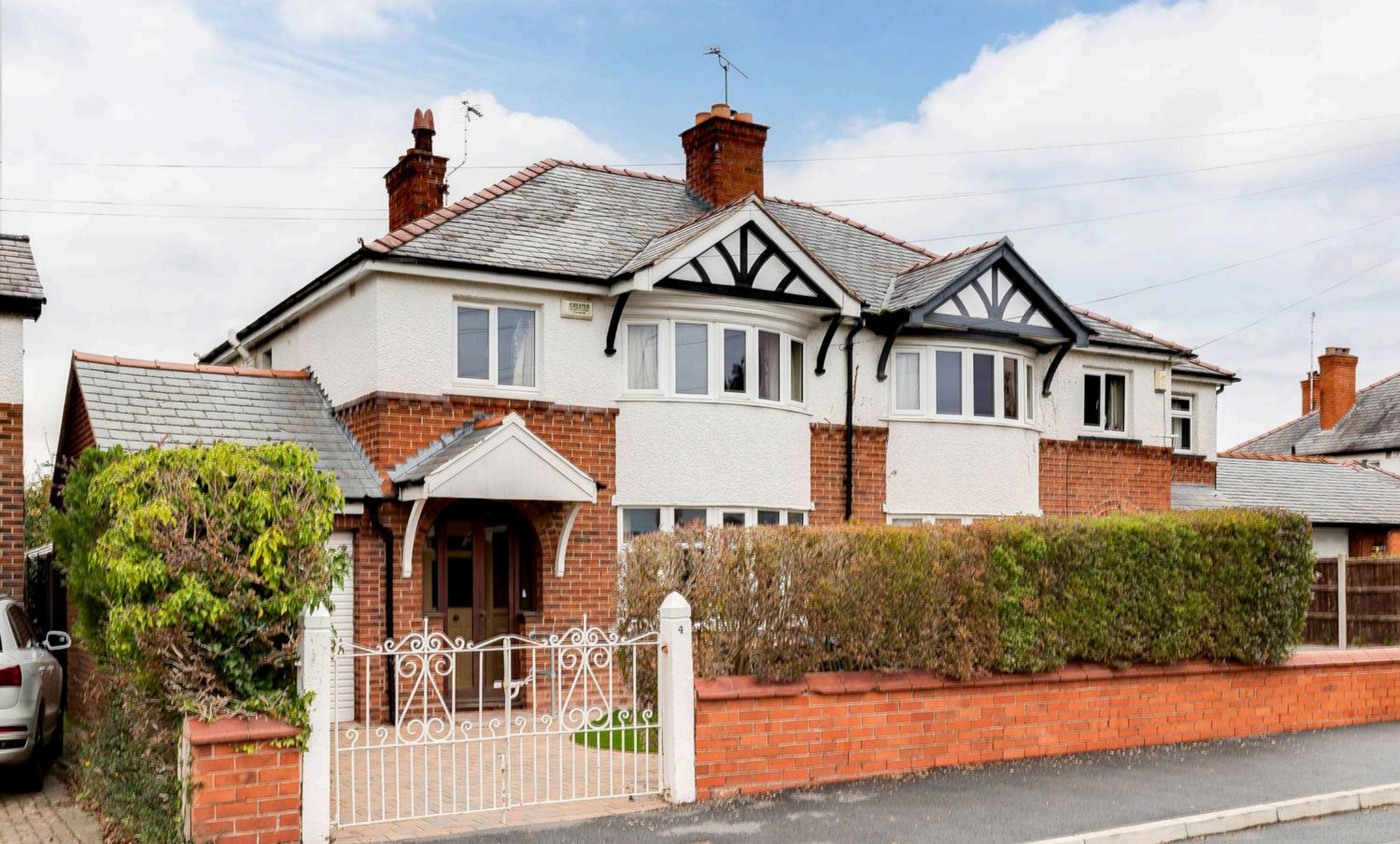
4 Marlston Avenue, Chester £340,000