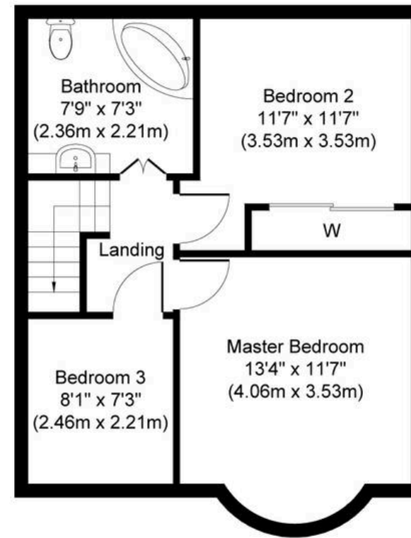
First Floor Approximate Floor Area 456 sq. ft (42.32 sq. m)

Whilst every attempt has been made to ensure the accuracy of the floor plan contained here, measurements of doors, windows, rooms and any other items are approximate and no responsibility is taken for any error, omission, or mis-statement. The measurements should not be relied upon for valuation, transaction and/or funding purposes. This plan is for illustrative purposes only and should be used as such by any prospective purchaser or tenant. The services, systems and appliances shown have not been tested and no guarantee as to their operability or efficiency can be given.