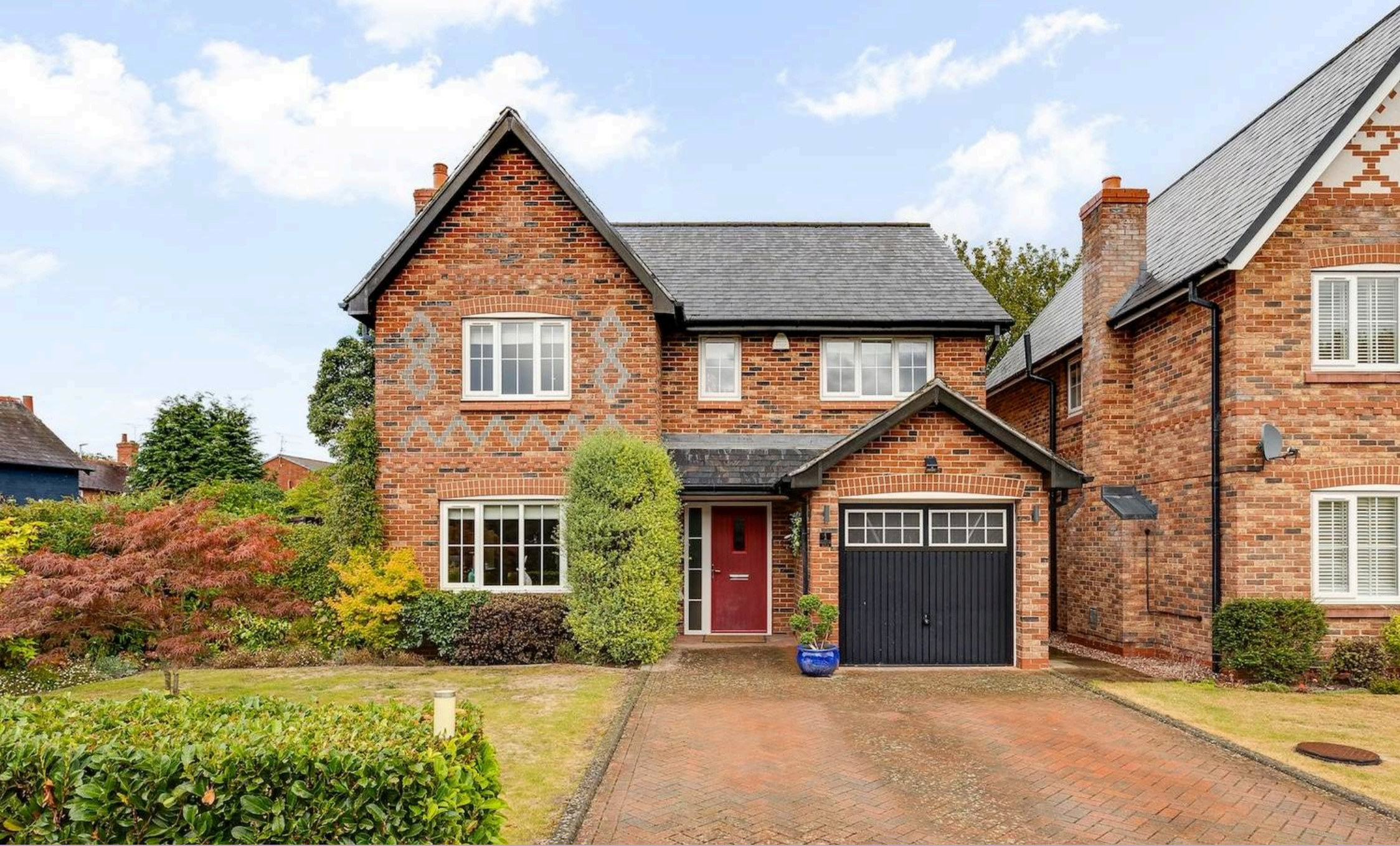
1 Oaklands Court, Rossett £540,000