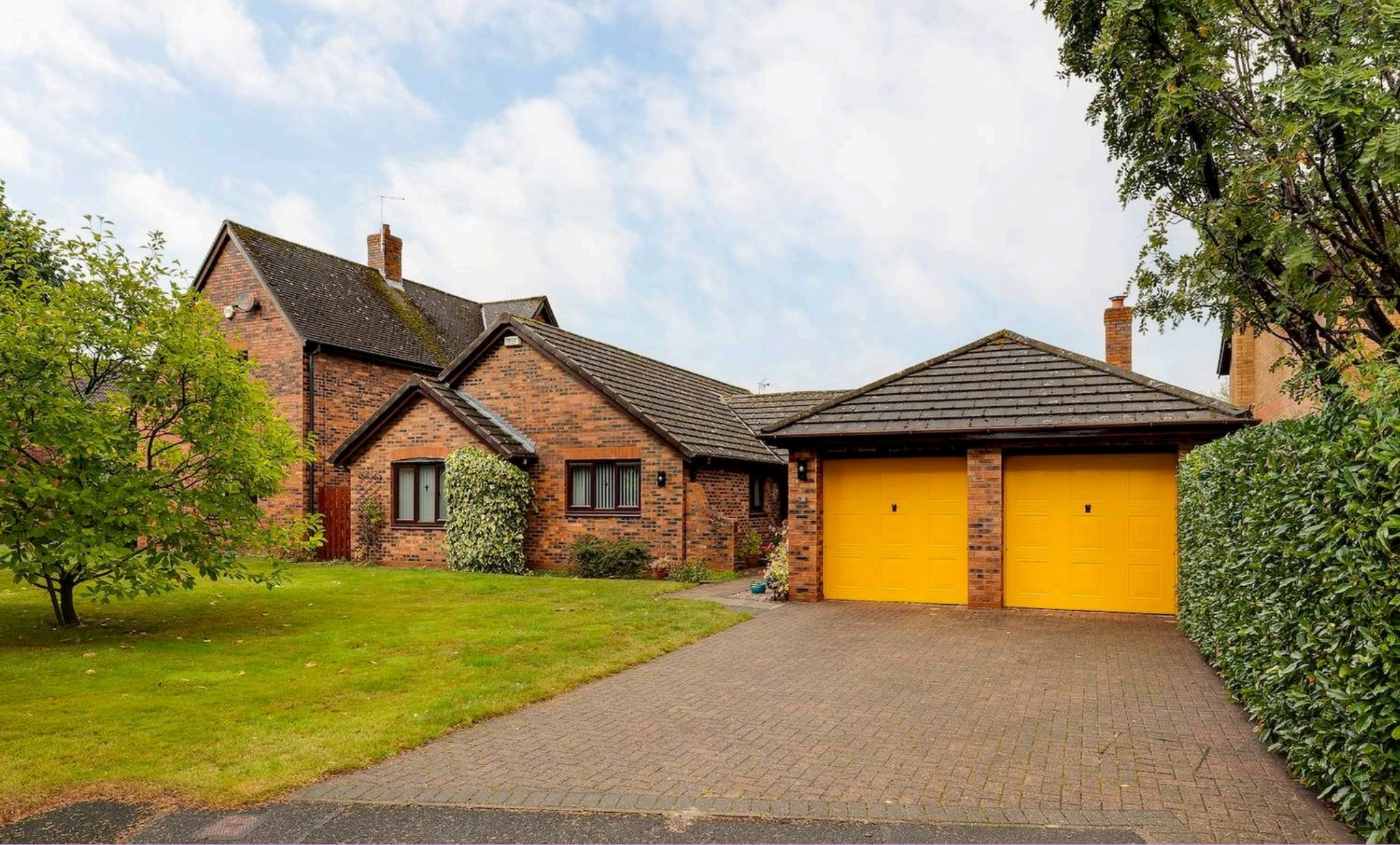
31 Adder Hill, Great Boughton £499,000