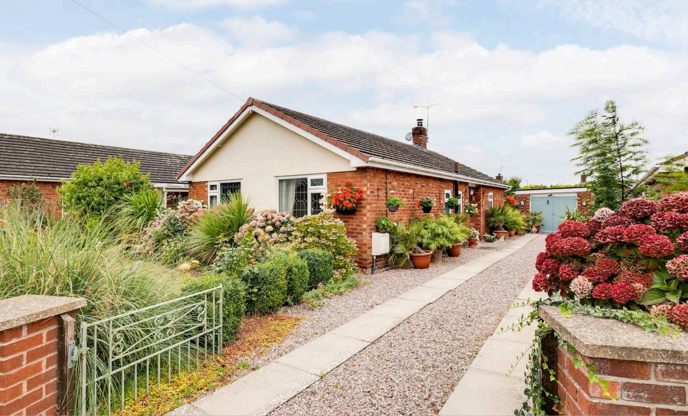
11 Townfield Avenue, Farndon £340,000